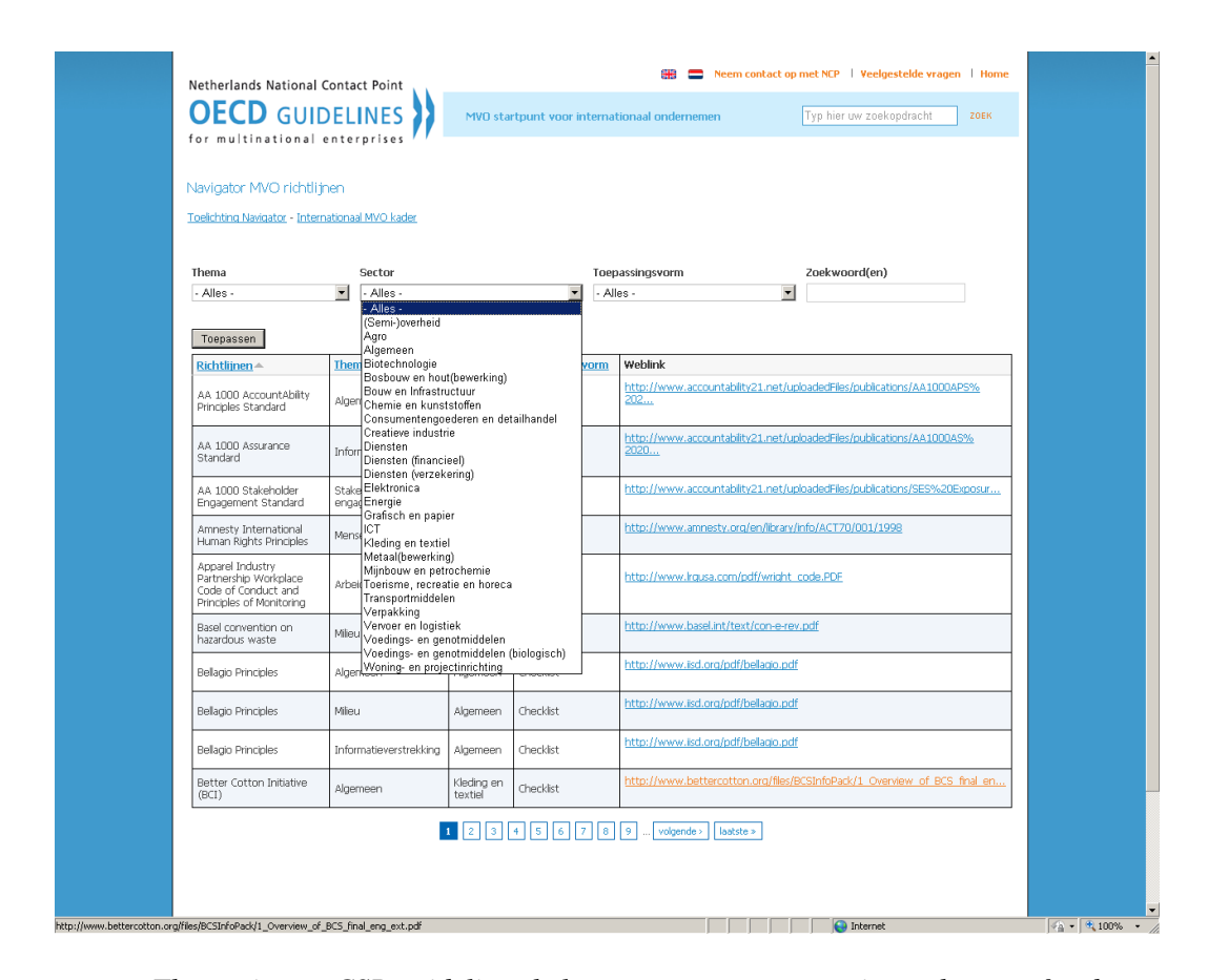
The navigator CSR guidelines helps entrepreneurs to navigate the sea of codes

All sectors mentioned here are integrated in the Navigator CSR Guidelines, which was developed by the NCP last year. This tool helps enterprises to navigate the great amount of CSR codes and serves as the starting point for international corporate social responsibility. Entrepreneurs, sector associations and members of the parliament often articulated the need for a 'roadmap' for individual firms in specific sectors on how to select and implement the most applicable code. The Navigator is tested by 10 sector associations and uses the OECD guidelines (themes) as starting point for formulating (more detailed) themed programmes under each guideline, such as SA8000 (labour), ISO 14000 (environment) or GRI (disclosure and transparency) and also provides sector specific codes of conduct. The tool is now available as 1.0 version on the Dutch NCP website: <a href="http://www.oesorichtlijnen.nl/navigator">http://www.oesorichtlijnen.nl/navigator</a>. The navigator yielded much publicity. In the summer of 2010, the Navigator will be updated and improved in a 2.0 version.